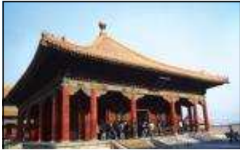
Beijing—The forbidden City

China is set to ratify the UN Convention on Human Rights of Persons with Disabilities as it prepares to host the Beijing Paralympics Olympics.