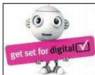
Are you ready for digital?

The scheme provides people on pension credit, income support and income-based jobseeker's allowance with a free set-top box, free installation and advice on how to get started. People outside those categories can have the help package for £40 if they are over 75; blind or partially sighted; claiming disability living allowance, attendance or constant attendance allowance.