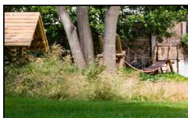
The new and improved Normand Park

The spectacularly transformed Normand Park is now open to the public. This comes from a £3 million investment from Hammersmith and Fulham Council neighbourhood regeneration programme, North Fulham New Deal for Communities (NDC) and Arts Council England. The improvements are part of a programme of investment in key parks by the council.